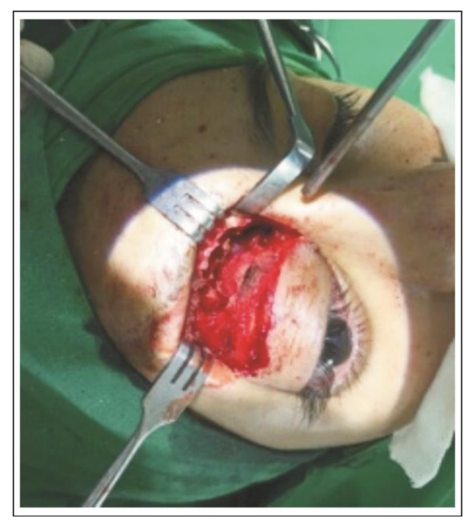
Fig. 4: Frontal Orbitotomy with incision made just beneath the eyebrow along its whole length.

incision was made just beneath the eyebrow along its length to gain access to the superior orbit and the frontoethmoidal region. Soft tissue was dissected until the periosteum was reached which was divided with No. 11 scalpel blade. The periosteum was separated from the underlying bone with a freer periosteum elevator. Frontal osteotomy was done using a round fluted burr (Figure 4). This allowed an entry to the supra orbital space and the mass was identified and removed piece meal from the orbital, frontal and ethmoidal region and was found to be pink fleshy and firm in consistency (Figure 5). The mass was sent for biopsy. The wound was closed in 3 layers: the periosteum and muscles with Vicryl 6/0 and the skin with prolene 5/0 interrupted sutures. A redivac drain was also placed in the wound and was removed after 24 hours as the fluid collected was 30 ml only. Patient was given oral broad spectrum antibiotics and steroids and an antibacterial ointment for topical use for 10 days. Skin sutures were removed after 8 days.